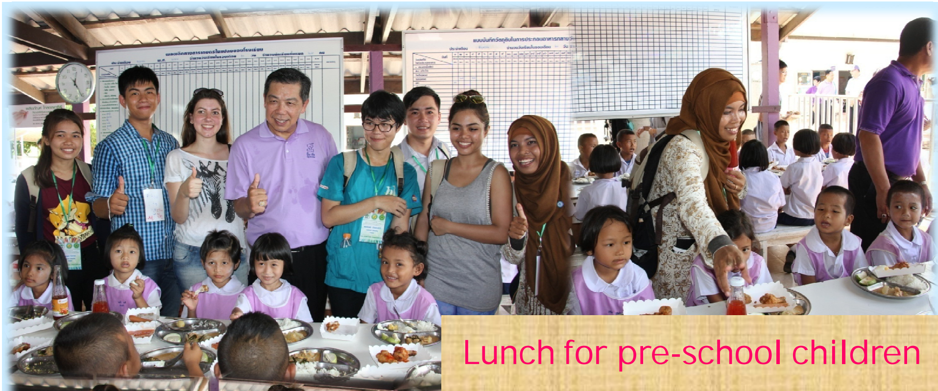
Lunch for pre-school children