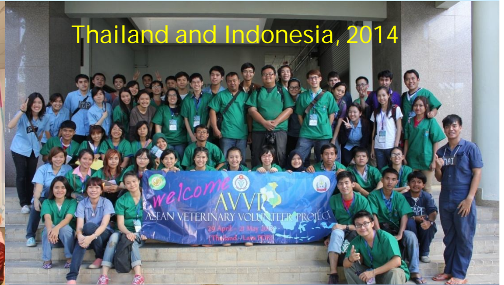
Thailand and Indonesia, 2014