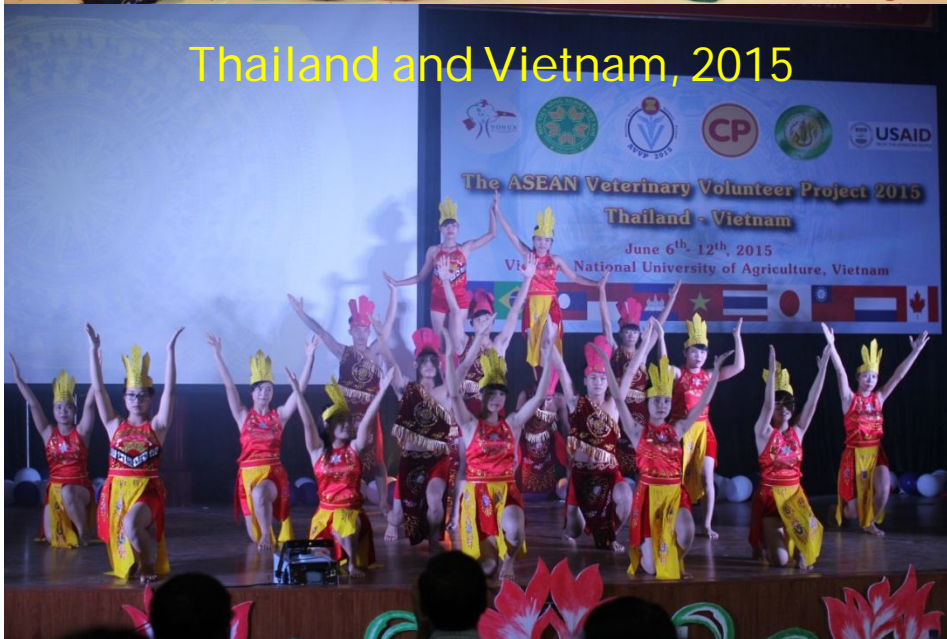
Thailand and Vietnam, 2015