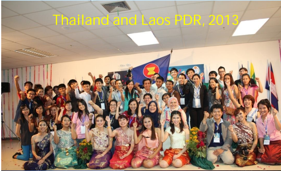
Thailand and Laos PDR, 2013